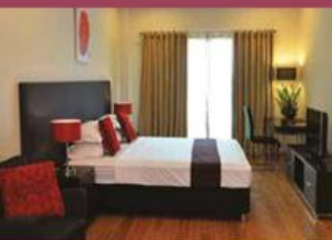
Hotel Timor Plaza

4 Day Trekking Mt. Ramelau Package starts from US $1,171pp twin sharing