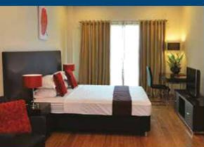
Hotel Timor Plaza

8 Day Magical Nature Package starts from US 1,780pp twin sharing